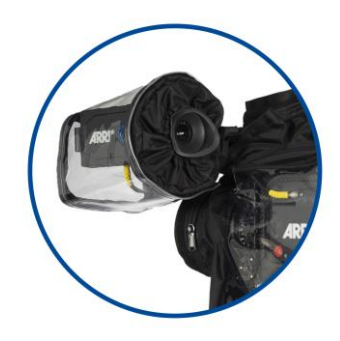
Capture the perfect shot with the separate LCD screen and viewfinder covers.