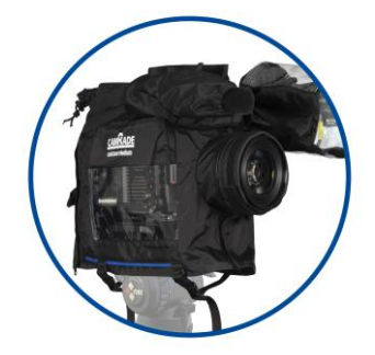
Spacious interior to hold the camera including rig, cage and/or top handle.