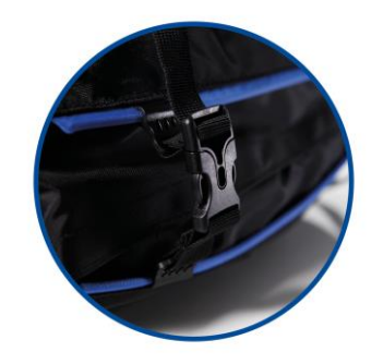
Bring the buckles to the desired position with the blue sliding rail.