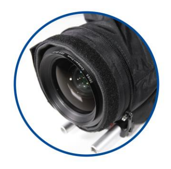
Rubber strip on the front of the cover ensures seamless closure.