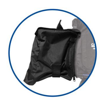
Cover large batteries with the Battery Extension Cover (included in package)