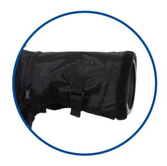
The option to expand with longer lenses thanks to the camRade lensC support.