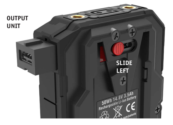
REAR OF BATTERY

8.1 Mini PAGlink batteries feature built-in D-Tap outputs (unregulated) designed for powering 12V camera accessories. They also incorporate a USB output unit, regulated at 5V (2A), which is interchangeable with other output unit types: Hirose (4-pin), Lemo (2-pin) & D-Tap.