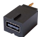
USB (2A) PAG-9712U