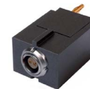
Lemo (2-Pin) PAG-9712L