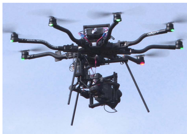
Designed for use on unmanned aerial vehicles.

PAG has incorporated its own proven and tested electronic protection system, to ensure the highest possible level of safety. All PAG Li-Ion batteries are tested to UN standards by an independent, authorized facility, in order to meet Air Transport authority regulations. Each battery is labelled with the UN test number and an Air Safety document. In addition to UN testing, a capacity below 100Wh ensures that the battery is flight-friendly and suitable for transport on aircraft, with a quantity restriction of 20 units per person.